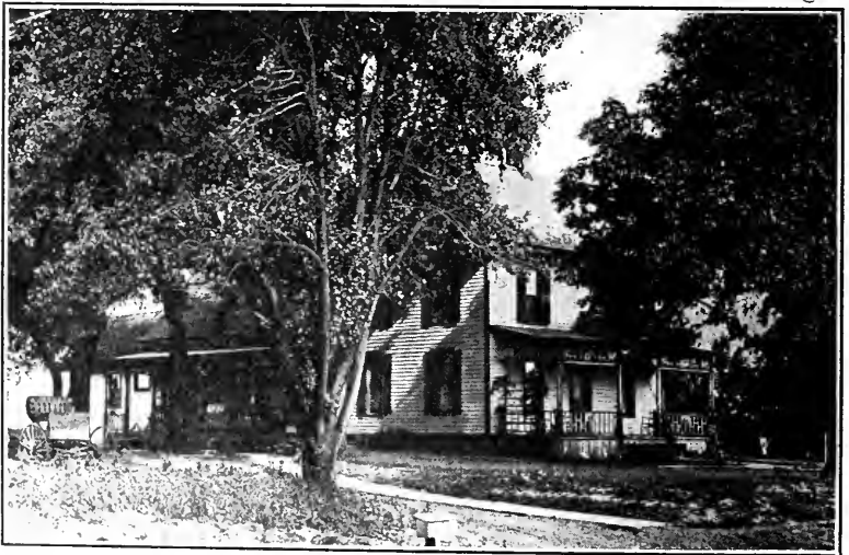
Remodeled former home of Joseph Smith, the Prophet, in Kirtland, Ohio

When we stop to consider that the Prophet Joseph Smith was but fourteen years of age when his first announcement of revelation from the heavens was declared, and that his ministry covered the brief space of only fourteen years from the organization of the Church until his martyrdom, at the age of thirty-eight years, what he accomplished for the salvation of man is wonderful to behold. He was not trained in the schools of his time, and he was considered by his enemies to be an unlearned man; yet, in the light of his life's labors we are forced to say indeed that what he did has proved to be "a marvelous work and a wonder." Thus through the weak things of the world have come forth strength and power which have broken down the mighty and the strong ones, whose wisdom has perished and whose understanding has been hid.